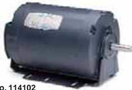
Cat. No. 114102