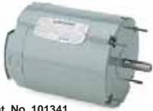
Cat. No. 101341