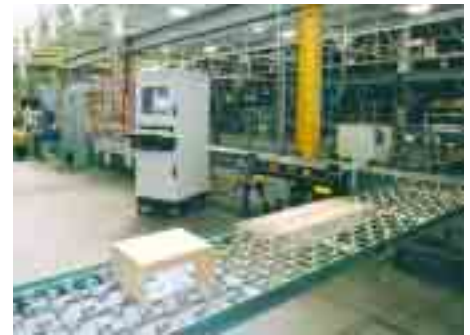
FloStor's material handling installation at Peet's Coffee & Tea (control station at center)